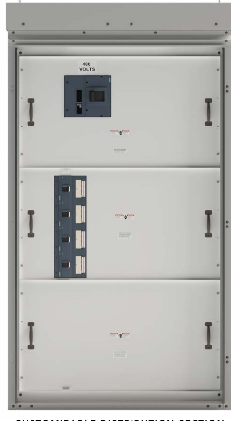
CUSTOMIZABLE DISTRIBUTION SECTION