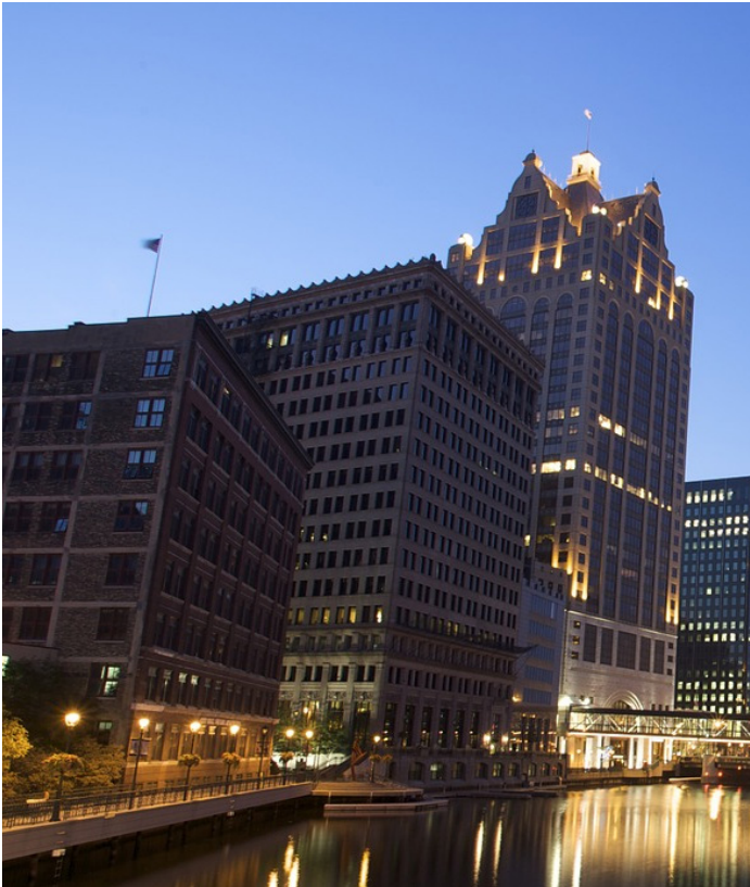
Downtown Milwaukee has limited space for power distribution.