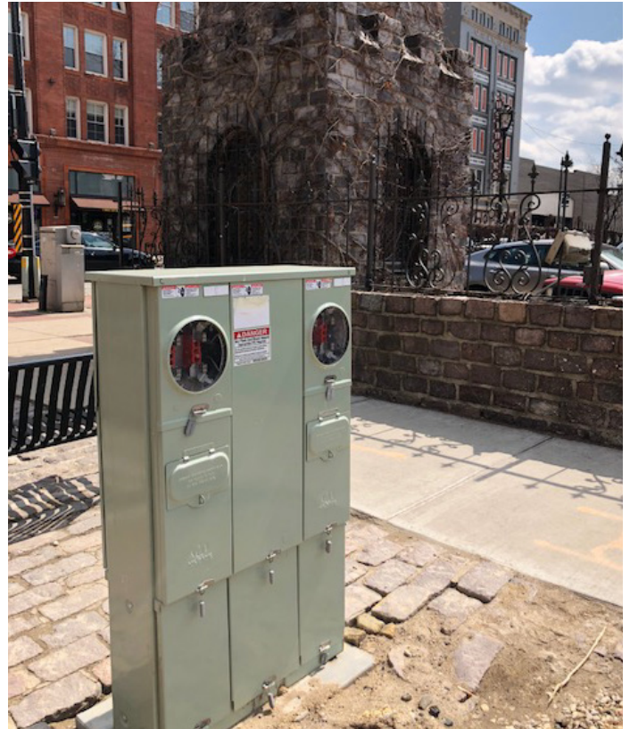
K6342 installation in downtown Milwaukee.