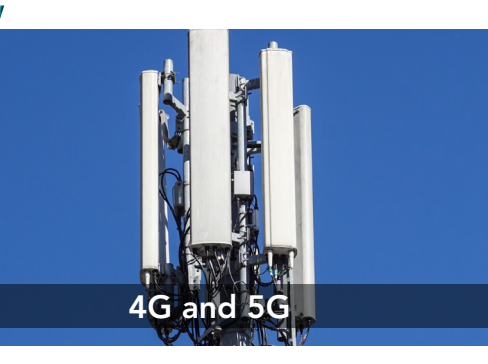
4G and 5G